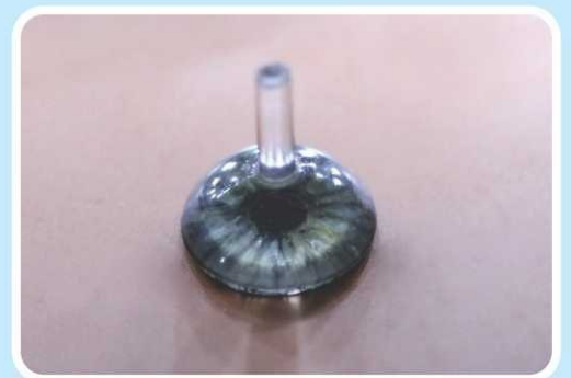
Hand painted life-like iris at IPEC

Ocular Prosthesis is needed for those individuals, who suffer with loss of normal anatomical structures of the eye, and seek for cosmetic and functional outcome. Loss of an eye can be at any stage, and can be treated at any age. IPEC offers wide range of ocular prosthetic services.