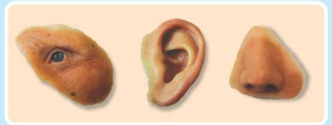
Orbital, auricular, nasal prosthesis fabricated by Deepa D Raizada

Maxillofacial prosthesis is indicated in cases with facial defects caused due to congenital or acquired conditions. IPEC offers wide range of prosthetic rehabilitative services for any type of orbital, auricular (ear), nasal and maxillary defects.